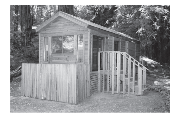
-Forest & Meadow View Cabins-*with kitchens

On weekends, Fernwood hosts live entertainment featuring many local bands and touring acts.